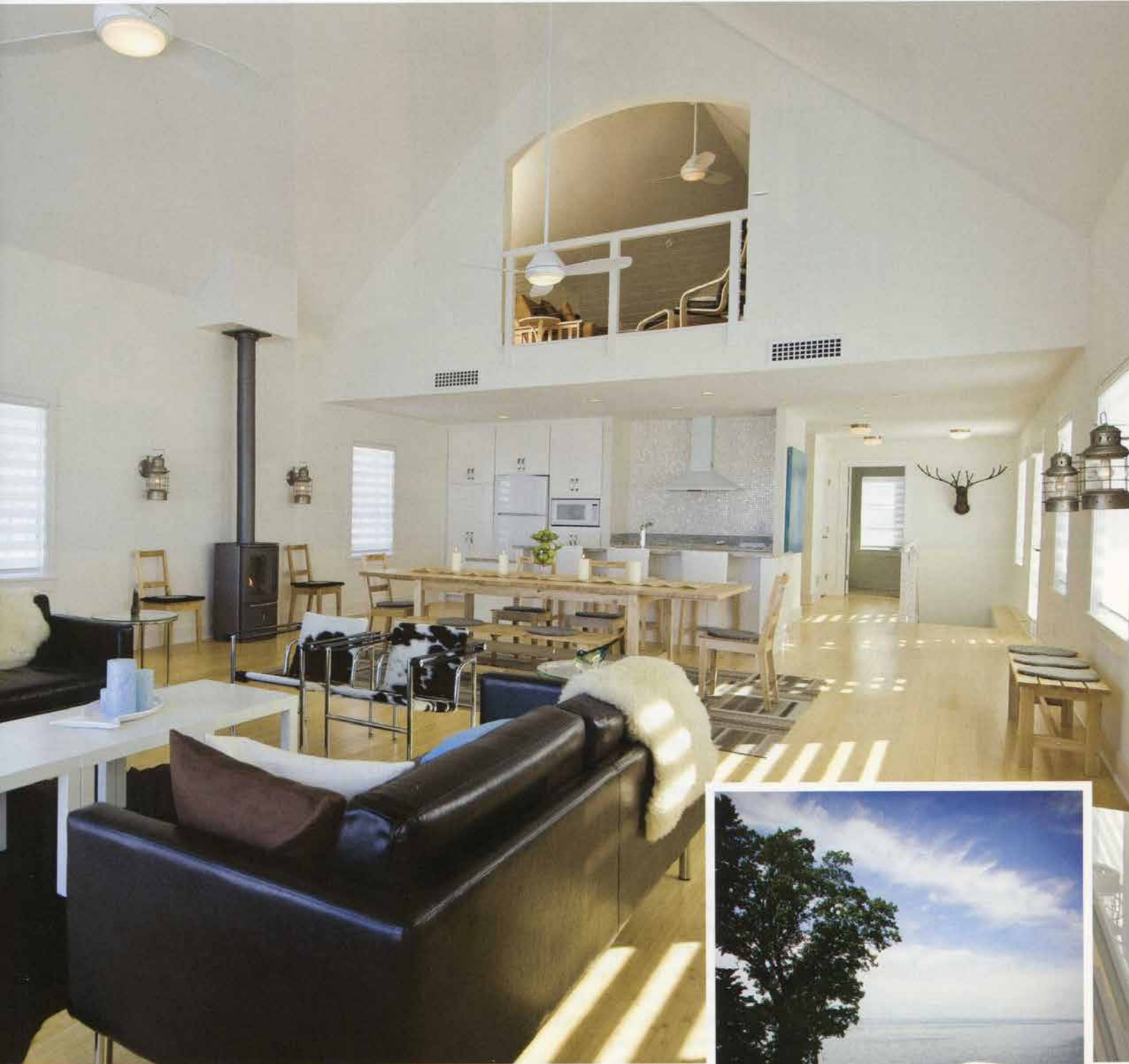
ABOVE: Carefully chosen furniture, art, and lighting prove that less is more in the main floor living space.