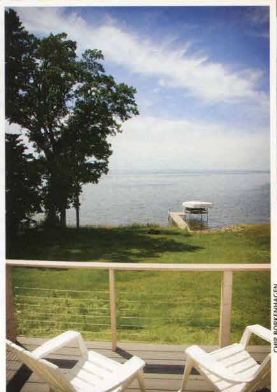
RIGHT: Perched atop a hill, the weekend retreat offers stunning views of Mille Lacs Lake.